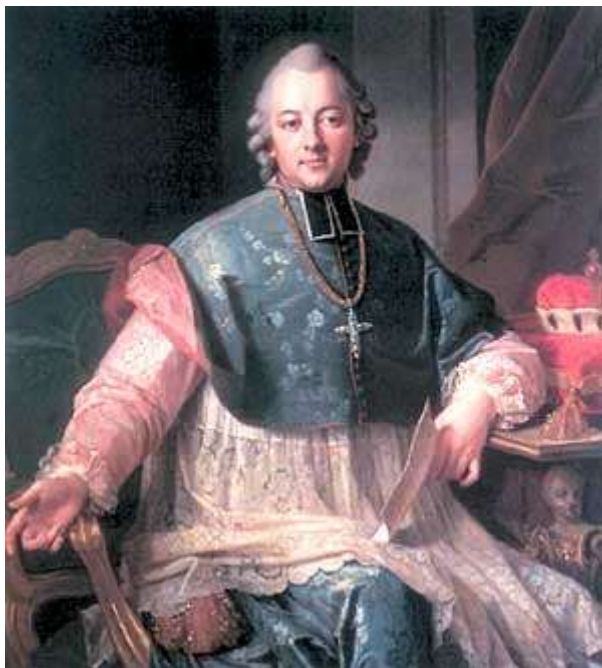
Ignacy Krasicki (1735 - 1801)

The Poland's DVALD project's traditional story character is Nicholas Experiensky, the main character of the Mikołaja Doświadczyńskiego przypadki ( The Adventures of Nicholas Experiensky ) novel, written by Ignacy Krasicki and released in 1776. The work is considered to be the first Polish novel.